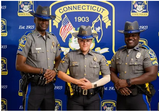
Connecticut State Troopers

The American Legion Connecticut State Police Youth Week is designed to provide an insight into the training and professional expectations of a police officer. The program is mentally and physically demanding, patterned after recruit training at the State Police Training Academy. It offers an excellent opportunity for students considering a career in law enforcement to gain first-hand knowledge of the training and duties of a police officer. The program is NOT a recreational camp, nor a disciplinary camp for problem youths. Students must be recommended for the program, be in good academic standing, and physically fit. Training is conducted in a paramilitary atmosphere, fostering a positive attitude among the cadets and enabling them to achieve goals they may have imagined as unattainable.