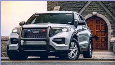
Connecticut State Police

“I wasn’t really thinking of joining the police before this. Now, I think that law enforcement is the direction I am heading. I truly hope that the cadets in the next State Police Youth Week get as much out of it as I did.”