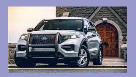
Connecticut State Police

"I wasn't really thinking of joining the police before this. Now, I think that law enforcement is the direction I am heading. I truly hope that the cadets in the next State Police Youth Week get as much out of it as I did."