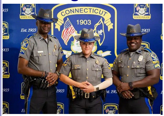
Connecticut State Troopers

The American Legion Connecticut State Police Youth Week is designed to provide an insight into the training and professional expectations of a police officer. The program is mentally and physically demanding, patterned after recruit training at the State Police Training Academy. It offers an excellent opportunity for students considering a career in law enforcement to gain firsthand knowledge of the training and duties of a police officer. The program is NOT a recreational camp, nor a disciplinary camp for problem youths. Students must be recommended for the program, be in good academic standing, and physically fit. Training is conducted in a paramilitary atmosphere, fostering a positive attitude among the cadets and enabling them to achieve goals they may have imagined as unattainable.