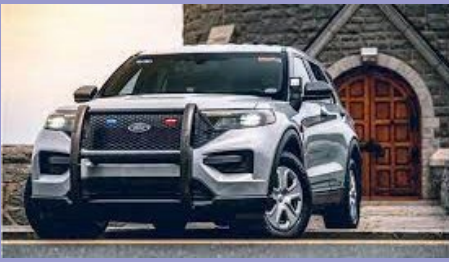
Connecticut State Police

“I wasn’t really thinking of joining the police before this. Now, I think that law enforcement is the direction I am heading. I truly hope that the cadets in the next State Police Youth Week get as much out of it as I did.”