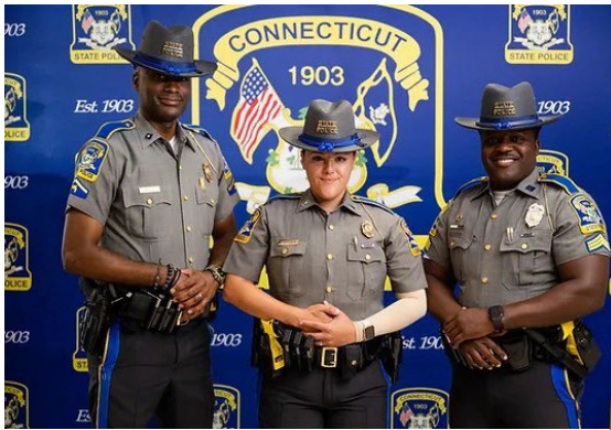
Connecticut State Troopers

The American Legion Connecticut State Police Youth Week is designed to provide an insight into the training and professional expectations of a police officer. The program is mentally and physically demanding, patterned after recruit training at the State Police Training Academy. It offers an excellent opportunity for students considering a career in law enforcement to gain first-hand knowledge of the training and duties of a police officer. The program is NOT a recreational camp, nor a disciplinary camp for problem youths. Students must be recommended for the program, be in good academic standing, and physically fit. Training is conducted in a paramilitary atmosphere, fostering a positive attitude among the cadets and enabling them to achieve goals they may have imagined as unattainable.